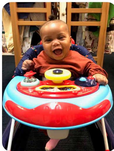
You make hearts smile by helping mothers choose LIFE!

We hope you can participate in our summer picnic and fall banquet! More details will be posted soon at www.maubc.org .